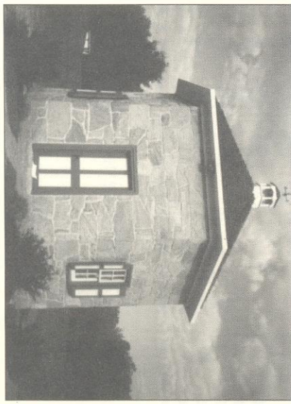
Caln Hexagonal School House